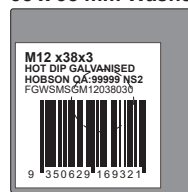
38 x 38 mm Washer

Applicable to: FGWSMSGM10050030 FGWSMSGM12050030 FGWSMSGM16050050 FGWSMSYM12050050