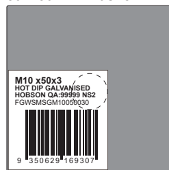
50 x 50 mm Washer

Applicable to: FGWSMSGM10050030 FGWSMSGM12050030 FGWSMSGM16050050 FGWSMSYM12050050