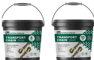
Heavy duty plastic bucket with lid