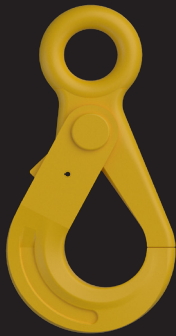
Safety Hook with Clevis ULHK08PSE