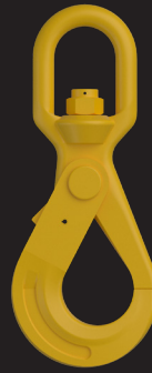
Safety Hook with Swivel ULHK08PSS