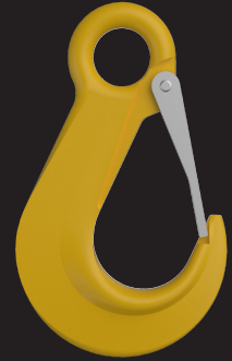
Sling Hook with Eye ULHK08PLE