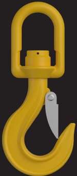
Latch Hook with Swivel ULHK08PAS