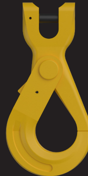
Safety Hook with Clevis ULHK08PSC