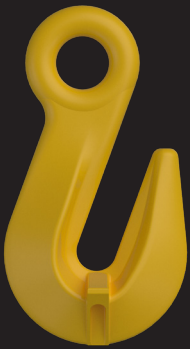
Grab Hook with Clevis ULHK08PGE