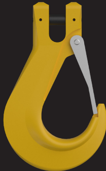
Sling Hook with Clevis ULHK08PLC