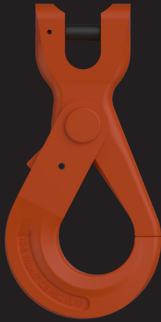
Safety Hook with Clevis ULHK10PSC