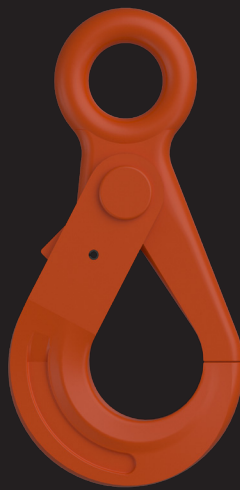
Safety Hook with Eye ULHK10PSE