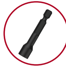
Recommended HEX 5/16 Magnetic Nut Setter