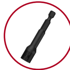
Recommended HEX 5/16 Spring Nut Setter

Disclaimer: while every reasonable effort has been made to ensure that this document is correct at the time of printing, Hobson Engineering®, its agencies and employees disclaim all liability in respect to anything or the consequences of anything done or omitted regarding the whole or any part of this document. HEC product marking is the manufacturing mark of Hobson Engineering. HEC is a registered trademark of Hobson Engineering.