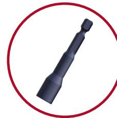
Recommended HEX 5/16 Magnetic Nut Setter