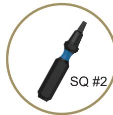
Recommended Square #2 Drive Bit

Disclaimer: while every reasonable effort has been made to ensure that this document is correct at the time of printing, Hobson Engineering®, its agencies and employees disclaim all liability in respect to anything or the consequences of anything done or omitted regarding the whole or any part of this document. HEC product marking is the manufacturing mark of Hobson Engineering. HEC is a registered trademark of Hobson Engineering.